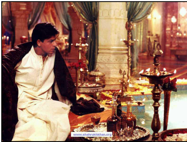
Figs. 1&2. Illustration of glory and wealth place in interior scenes (Devdas).

Film locations are two adjacent houses, and not