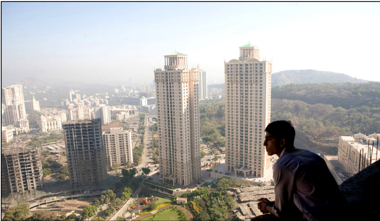
Fig.14. Dominate on town and the sense of regrets and sadness in Slumdog Millionaire.

ins for Jamal among the colorful towers for others. Soon after, the appearance films in this approach such Peepli Live (2010) by Anusha Rizvi Attracted the public's attention and finally this cinema gain to new spirit.