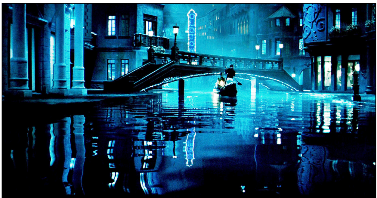
Fig.10. Bridge on the River, the most important place in film and story.