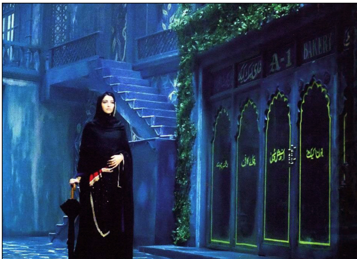
Fig.11. character and location Being on and define character by using place. Source: www.saawariyafilm.com .

However this film Produced by cinema in outside of India but This film and appreciated it, relying on the collective memory of the Indian audience, after year's reformed again Indian realistic approach.