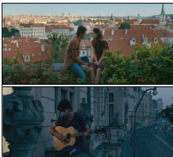
Fig. 4. Romantic sense of height with good background in non-Hindi movie (rock star)