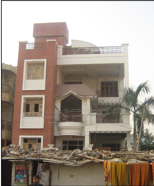
Figs. 12&13. sharp Class conflict neighboring with upper classes and stripped in one place.

Opposite of utopia that was pictured in Sawaariya, is Boyle's really devastated city. Bedouin tents and slum dwellers living, neighboring both high and down class, Slums and rich neighborhoods in cities like Mumbai, is a landscape raised from Economic contradictions (Figs. 12&13).