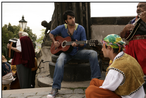
Fig. 3. remove Hindi signs and attraction into the western areas in Rock Star.

But Westernized modern cinema communicate with cultures developed countries, Without border location to the farthest European cities, western clothing and showing of modern life or the imita-