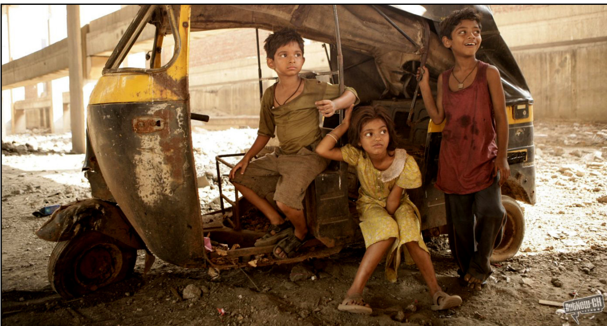
Fig.15. India's poor and desolate Alleys where Slumdog Millionaire played.