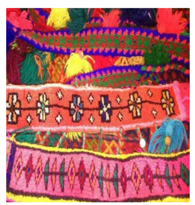
Fig. 4. Symbols of Mithraism in the handicrafts of Bakhtiari women.

and forgiveness and ransom. Women for easy fertility or childbirth and girls want to marry, wash themselves in these springs and resort to the goddess of fertility. Holding rituals next to water, springs, and holy shrines during the harvest seasons are all relics of antiquity, whose appearance has been preserved but its content has changed and is in line with new beliefs. The ritual of sacrificing bulls during the years of drought and low rainfall in holly springs, which is a symbol of the ritual of Mehr, is still part of the customs of the Bakhtiari people. Mehr, the great Aryan god, and possessor of the wide plains of Anahita, the goddess of fertility and pure waters, was always worshiped by sacred springs and trees, and many sacrifices were made for them.