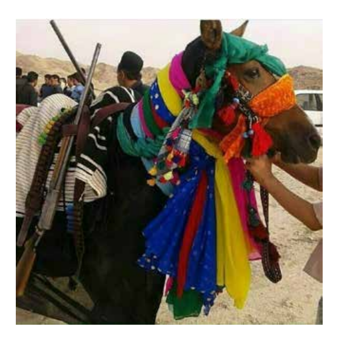
Fig. 1. Kotal ritual in mourning.

Fire is another symbol of the sun. The ancient Iranians considered fire as a symbol of life, their national identity, or a stove and were proud of it. For Bakhtiari, a man was considered a symbol of the family and if a man did not have a child, he was a stove. They said they were blind because they believed that men were the ones who started the fire in the family and a person who did not have a son would not have a fire in his family. It seems that the word heredity is derived from the same principle, that is,