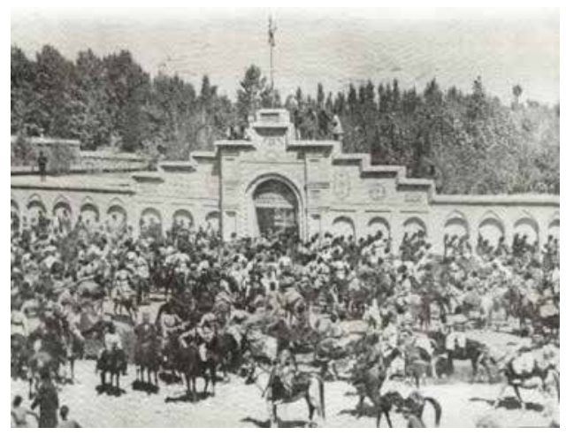
Fig. 1. Accession to the British Consulate in Zand Avenue, Qajar era (1277).

So, the remaining basis from the zandstreet in safavi period is an axis which the 2 sides of its walls are gardens related to the rulers. In zandie period, the construction of some building in Darbshazde and near the Bagh shah gateway mainsail the importance of this street. Thought out the naseri period there was a square next to the citadel of karim khan called artillery square which was the loca-