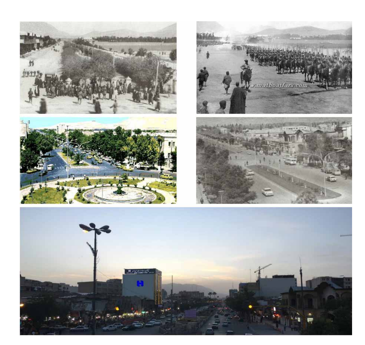
Fig. 3. social-physical evolution of areas around Arg of Karim Khan (Shahrdari Sq.) since Qajar dynasty. In top right: Indian soldiers Marching in Zand Street in Qajar dynasty (1912) - garden of British Embassy. Source: Book of "In the memory of Shiraz". In top left: Zand Street in Shiraz in Pahlavi dynasty (1928). Garden of British Embassy. Source: Book of "In the memory of Shiraz". In middle right: Zand Street in Pahlavi dynasty (fortieth decade of solar year) - the Embassy's garden and others were faded, the vegetation was changed, and the texture was disintegrated. Source: Book of "In the memory of Shiraz". In middle left: Zand Street in Pahlavi dynasty (fiftieth decade of solar year) - soldiers moving on foot and by horse. Source: Old Shiraz - Mansouri. Down of (presently named) Zand Street. Lack of controlling the vehicles, destruction of cultural tissue and lack of attention to that. Old tissues, microlith with maximum advertisements etc.