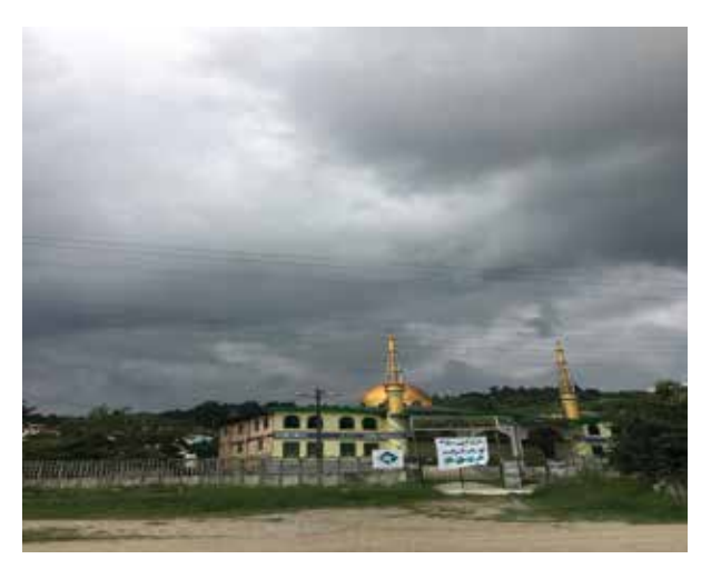
Fig.6. A mosque in Mazandaran Province. Photo: Shohre Javadi, 2016.