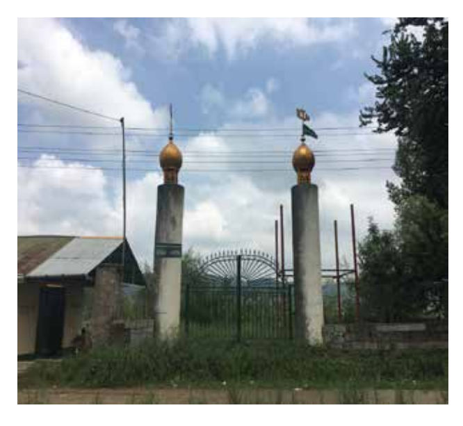
Fig. 9. The entrance of a graveyard, Shirghah, Mazandaran.