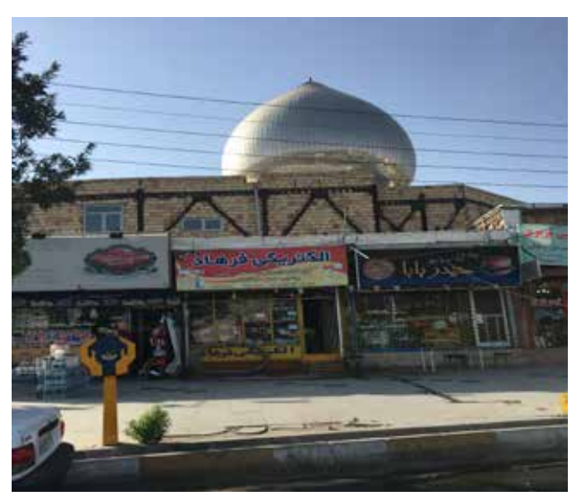
Fig.7. A mosque in Firoozkooh, Mazandaran.