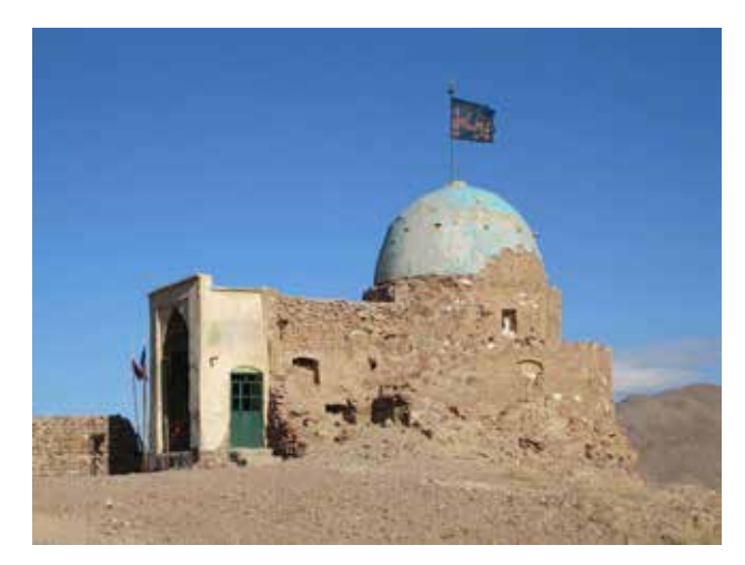
Fig.2. The shrine of Sheykh Andarabi, Kish.