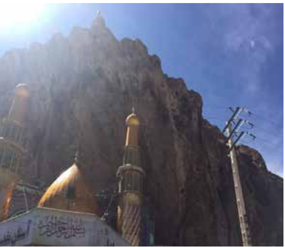
Fig. 11. Imamzadeh Ismaeil Shrine, a distinguished sample of a cave temple lies between huge rocks and beside a running river. The current appearance present facade of this place, like those of the other religious places nowadays, is covered with common decorations. Firoozkooh, Mazandaran. A small part of rock seen between the mirrors; before mirroring (Aina-Kari), the holy shrine was in the middle of huge rocks and had created a splendid huge awewonder.