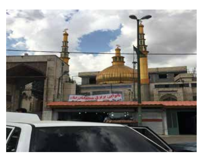
Fig.5. A mosque beside the Firoozkooh-Shirgah road. Photo: Shohreh Javadi, 2016.