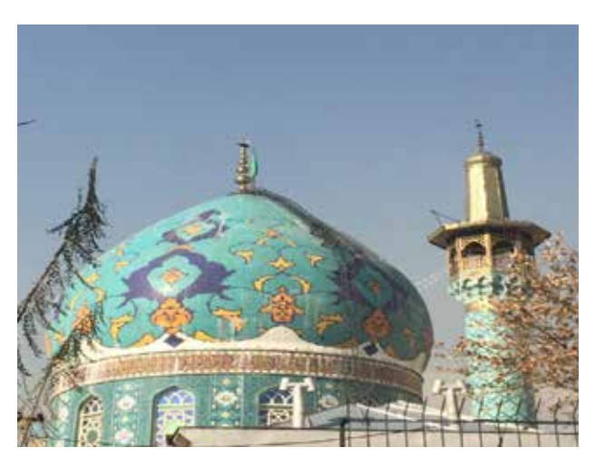
Fig. 8. Imamzadeh Salih. Tajrish, Tehran. photo: Shohre Javadi, 2016.

sacrificed for business and profit, even the sacred heritage of a nation that is traded by dealers in the vanity fair of desire and gain. The ritual buildings, texture, spaces, and places of our country are threatened by damages, distortions, and serious pests more than any time. This precious heritage in its time was a live manifestation of a rich culture and lifestyle from politeness, decency, spirituality. and cleanness. Nowadays the entire of principal and common virtues and values of human societies and the world are disappearing. Every monumental construction at its historical time and situation along with the cultural, social, spiritual, economic, and political necessities of the time has been a lively and active reality on the scene of history, culture, and social life for the people who created it, affecting them. The influences of these monumental buildings and places on the soul, behavior, wisdom and mind, and taste of the people of the very period have been direct and immediate. Yet, the people coming in the next centuries and millenniums developed another understanding of these monuments. This understanding is termed as rereading, representation, and rethought (Mollasalehi, 2014:69).