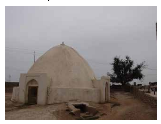
Fig.1. The shrine of prophet Salihin Abarkooh, Yazd.

Some of the rivers flowing beside the trees are dried or are surrounded by garbage! Everything is