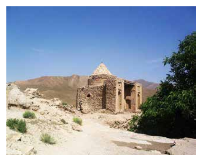
Fig.3. Imamzadeh Ali Shrine, Farouj, North Khorasan.