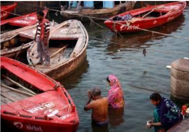
Fig 5. The Ghat, temples and palaces and boats, the edge of the Ganges river, Varanasi - Holy Baptism, the Ganges, Varanasi. Photo: Hoda Kameli, 2012.

infectious diseases in the community that are transported by air and water. Udaipur City Council has decided to disinfect by gases at the time of ceremony. (National Center for Disease Control in India).