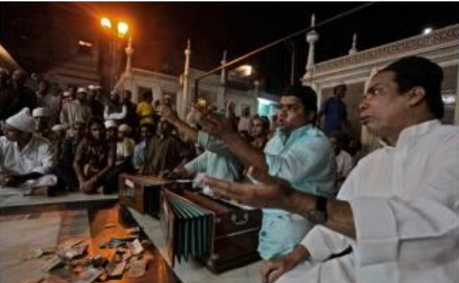
Fig 1. Right: Qawwali ceremony in the courtyard between the tombs opposite the port of Hazrat Nizamuddin, New Delhi. Source: http://kunzum.com/2010/11/17/delhi-enjoy-the-weekly-qawwalis-at-nizamuddin-dargah/Left: Gateway Hazrat Nizamuddin, New Delhi, Source:http://www.delhitravel.org/wp-content/uploads/2011/06/Hazrat-Nizamuddin-Dargah-Delhi-Picture-3.jpg