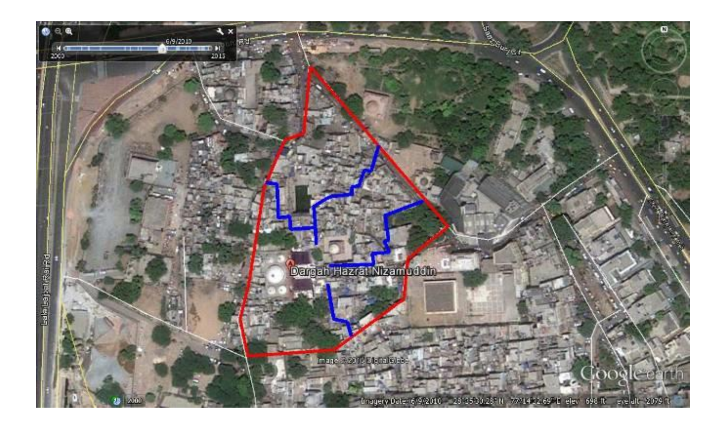
Fig 2. The adjacent spaces (tombs and mosques - residential area-access routes and markets)