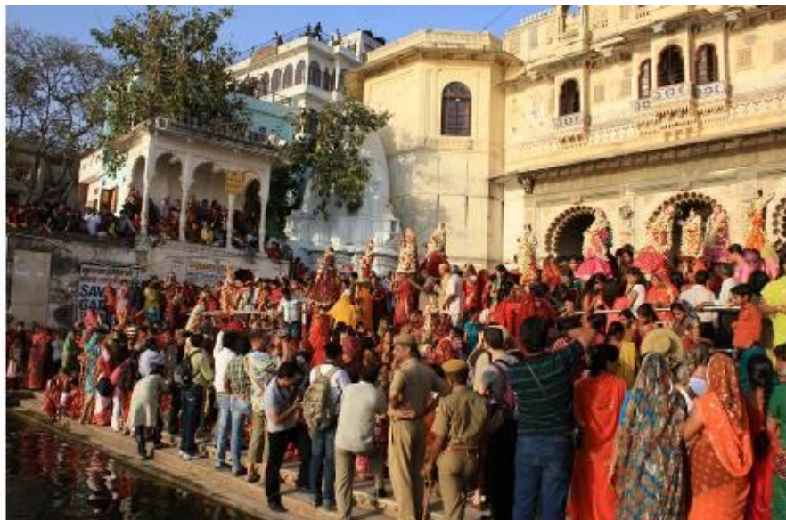
Fig 3. Mewvar Festival, the Gangaur Ghat gates, Udaipur. Photo: Hoda Kameli, 2012.

ple just passed by for pilgrimage the shrine of Nizamuddin.