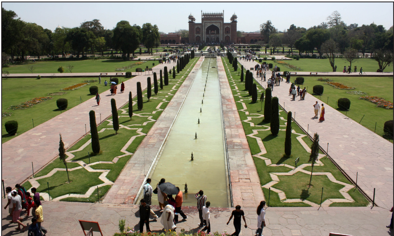
Fig.5. Stagnant water in the main axis of Taj Mahal, Agra.

Water has always been an omen of cleanliness and brightness and was so much valued in ancient Persia that the area of any garden depended on the available amount of water for irrigation. Shortage of water strengthened the value of this precious element of life. Perhaps this is why most Iranian gardens are located in hot and dry regions which lack vegetation to provide a convenient place for accommodation and pleasure.