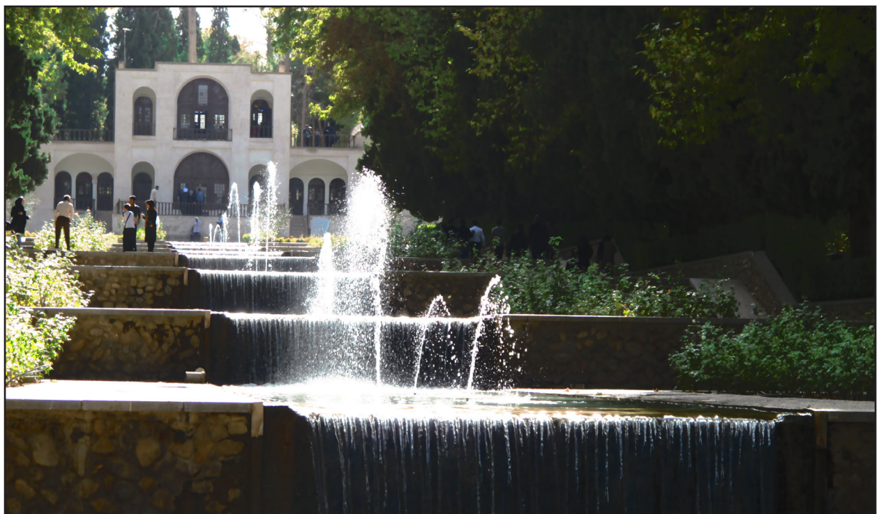
Fig.2. Waterfalls repeated in the natural slope and the overemphasized role of water in the main axis of Shahzadeh Mahan Garden, Kerman.