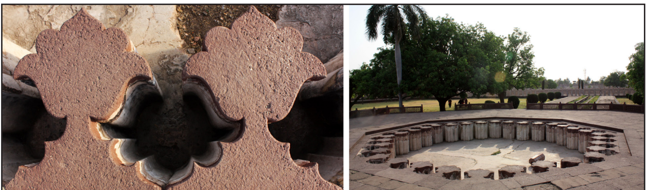
Fig.10. Highly decorated beds of ditches in Indian gardens, Bibi-ka tomb-garden, Aurangabad. Photo: Arezoo Shirdast, 2012.

Another significant point is the interaction between water and people in Indian gardens which distinguishes Iran and India. In Iranian gardens, this interaction is immediate, yet in Indian gardens there is an intermediary element called the green space which point to another decorative aspect of water in Indian gardens. In fact, plants are used as decorations in addition to the ditches design which confirms the decorative role of water in Indian gardens.