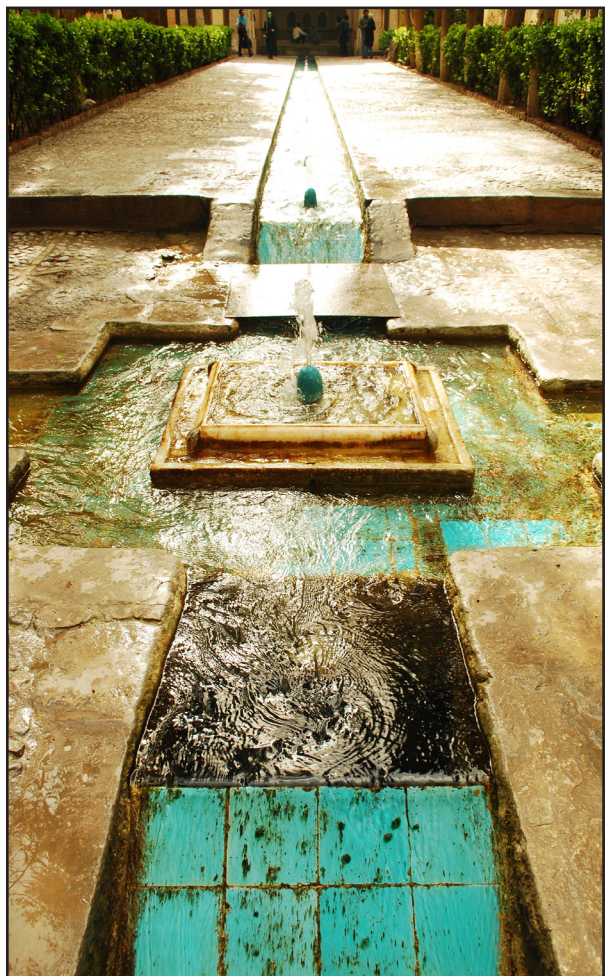
Fig.7. The use of running water in the walkways of Fin Garden, Kashan.

Not only was water used to meet the needs of Iranians, but also it brought about spiritual effects. Running water has been the main factor reviving Iranian gardens which moved in Charbagh, streams, and low-slope and winding ditches to refresh the air. So there was no other solution but a system of stream running all over the garden to cool the air, and create a shadowed and peaceful environment. These streams usually met to make ponds. On the contrary, in the temperate climate of India,