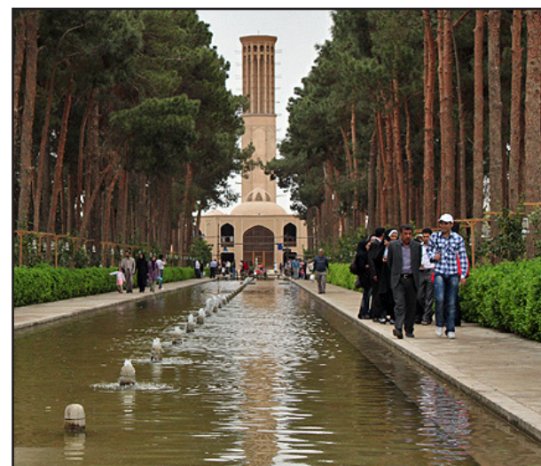
Fig.4. The proportion of water view dimensions with the wind-catcher height in Dolat Abad Garden, Yazd.

Charbagh, this style integrated with the local traditions and environment to take on an indigenous form. Mughal gardens had main waterways similar to idealistic style of quadrilateral scheme. For example, in Humayun Garden, the tomb is located in the center of the garden, which is completely similar to Iranian Charbagh. The architectural concept of the tomb which is located in the intersection of