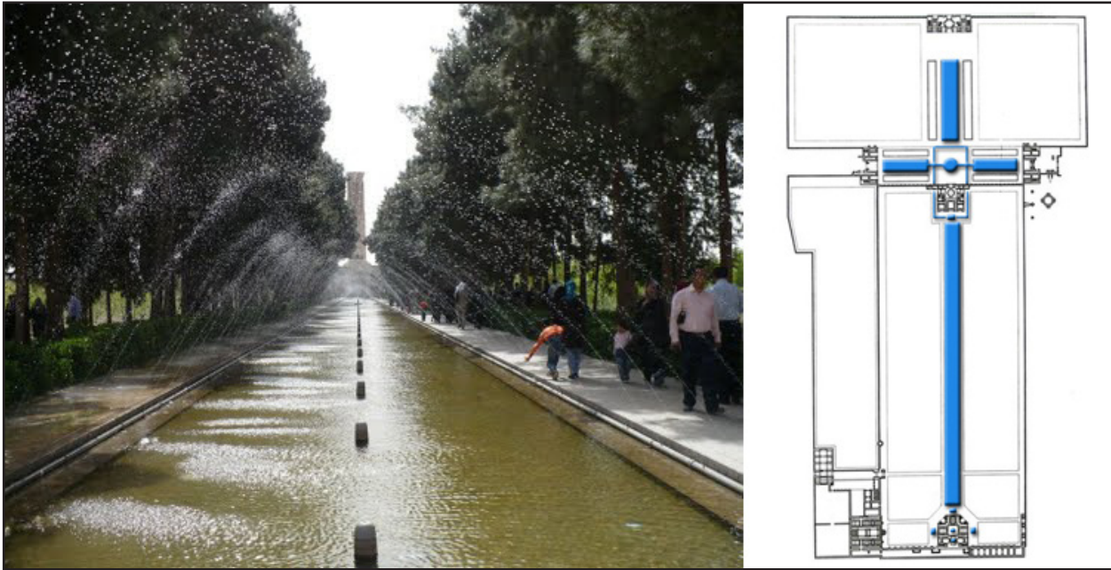
Fig.3. The overemphasized role of water in the main axis of Dolat Abad Garden, Yazd.

been deemed valuable in Iran, since it was known as the omen of light and purity in the ancient Persia. Water running in the four corners of Iranian gardens assimilates the four streams of water in the Paradise (Ansari & Mahmoudinejad, 2007). In fact, water is the most original and most pleasant common characteristics of Iranian garden (Heidar Nattaj, 2011: 60). Therefore, one can see the emphasized role of water in the main axis of Iranian gardens. For example, in Dolat Abad Garden, there is a heightened walkway, dominant on other walkways, in the main axis of the garden, which has a ditch in the middle leading to the main building and pool. This ditch provides a new looks by running through the main building and the garden (Omrani & Jeyhani, 2004), (Fig.3). The reflective property of water also influenced the design of large garden pools. It doubles the grandeur of the building by reflecting its picture. For instance, the water view of Dolat Abad Garden is exactly along the main axis and its dimensions match the octagonal building to completely reflect its picture (fig.4).