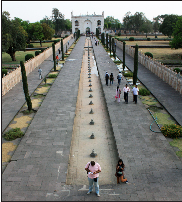
Fig.8. The use of pond with stagnant water in an Indian garden, Bibi-ka tomb-garden, Aurangabad. Photo: Arezoo Shirdast, 2012.