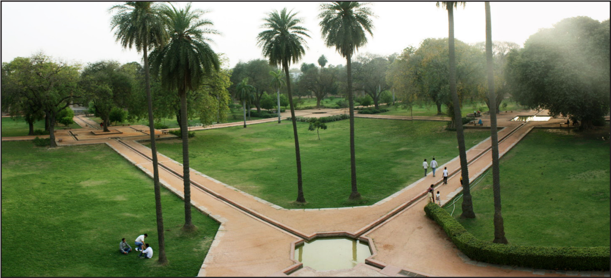
Fig.6. Narrow and shallow streams of water all over the secondary walkways in Humayun tomb-garden, Delhi.

In contrast to Iranian dry plateau, Indian hills are covered by thick vegetation making the Indian plain susceptible for agriculture. Due to Indian climatic characteristics and dry farming, Iranian-style garden design was independent on irrigation system. In most Indian gardens, the necessary water especially for decorative purposes was sourced from wells; therefore, Indian gardens were idealistically divided into four sections not out of necessity.