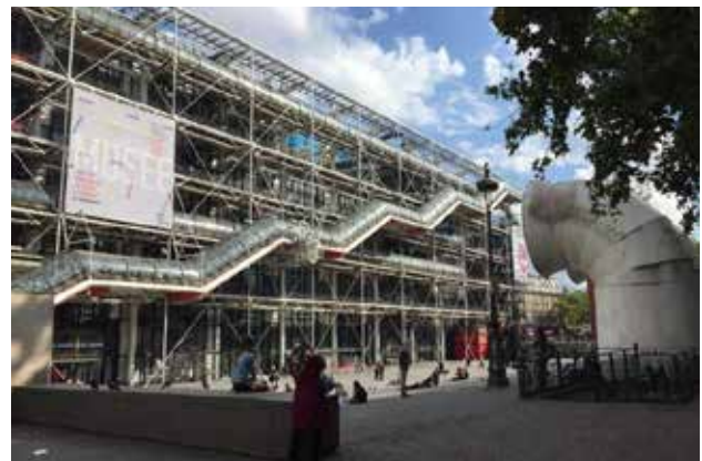
Fig. 1 & 2. George Pompidou and Fronted Open Space.