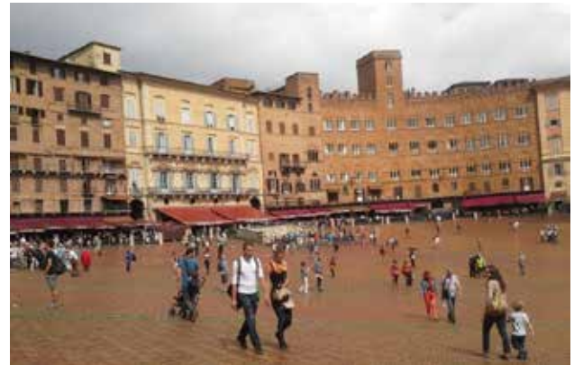
Fig. 5 & 6. Del campo Square in Sienna. Photo: Seyedeh Fatemeh Mardani, 2015.

Collect respondents' answers to George Pompidou's questions Museum showed that both men and women similarly replied to the space perception i.e. spatial elements of discipline, equilibrium and geometry were more masculine elements. Answers were slightly different about Place Massena in Nice meaning that the elements such as nature, mobility and flexibility were as interesting as the components such as geometry, discipline (order) and space structural elements for visitors. Respecting to spatial perception of Spanish Steps in Rome, elements including space fluidity, irregularity (in contrast to statics) and flexibility were prioritized by visitors; and finally, order, static space, as well as predetermined spaces and geometry were the components attracted visitors of Piazza Del Campo in Siena.