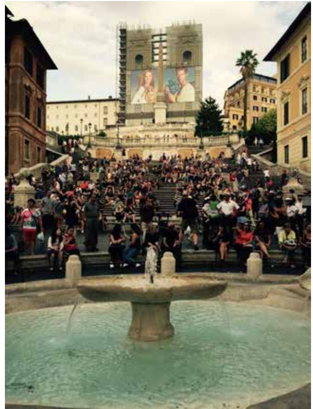
Fig. 7 & 8. Spanish Steps in Rome. Photo: Honey Arjmandi, 2015.