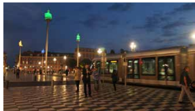
Fig. 3 & 4. Massena Square and its Open Space.