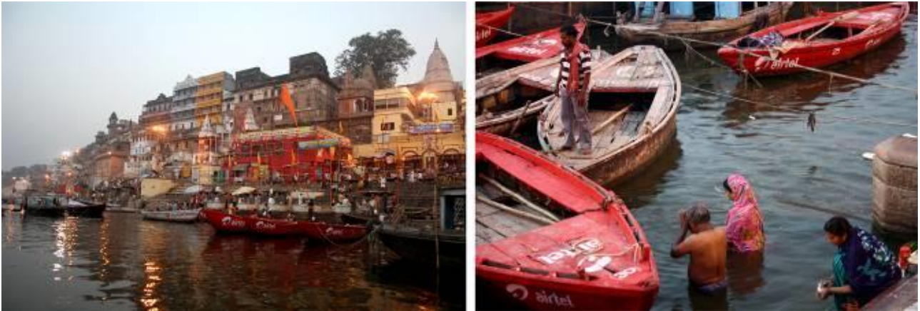
Fig 5. The Ghat, temples and palaces and boats, the edge of the Ganges river, Varanasi - Holy Baptism, the Ganges, Varanasi.

infectious diseases in the community that are transported by air and water. Udaipur City Council has decided to disinfect by gases at the time of ceremony. (National Center for Disease Control in India).