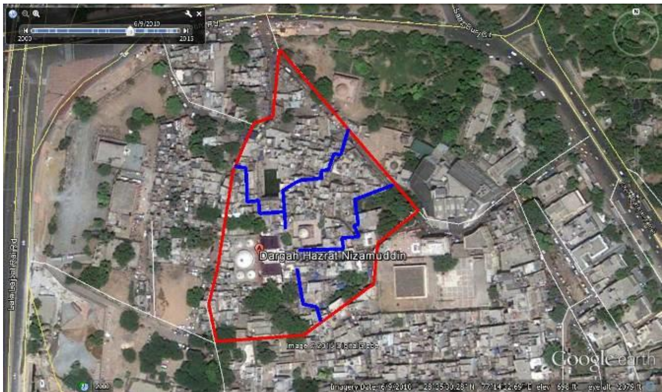
Fig 2. The adjacent spaces (tombs and mosques - residential area-access routes and markets)