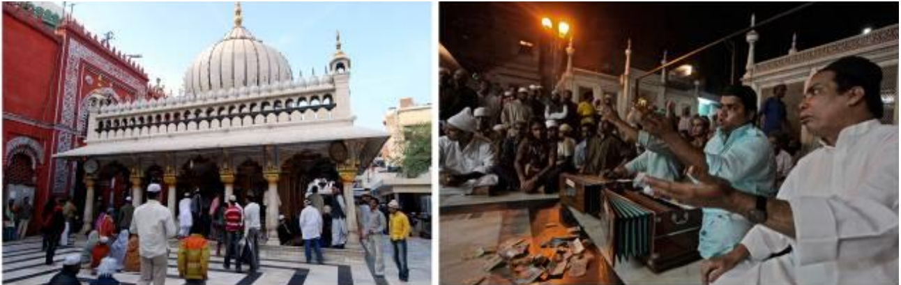
Fig 1. Right: Qawwali ceremony in the courtyard between the tombs opposite the port of Hazrat Nizamuddin, New Delhi. Left: Gateway Hazrat Nizamuddin, New Delhi