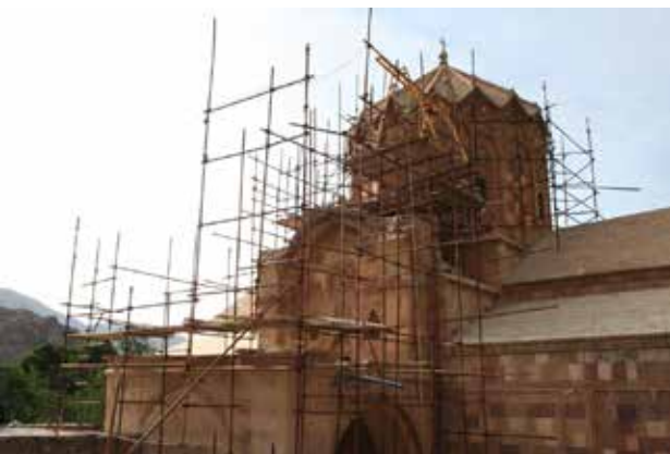
Fig3. A view of St. stephanos church.