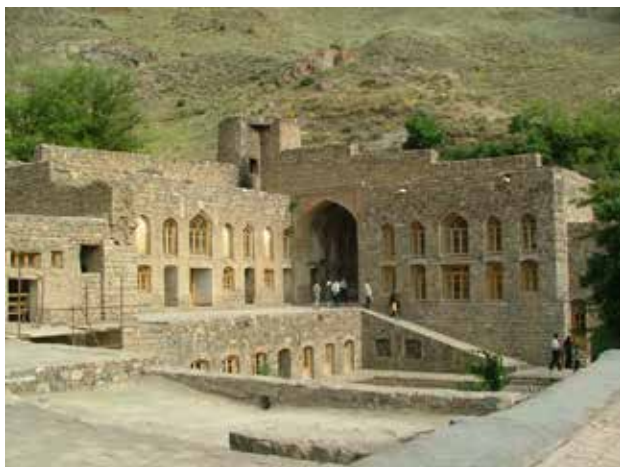
Fig.14. A view of a stone monastery next to the church.