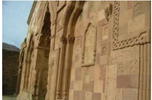
Fig.7. An example of church carvings