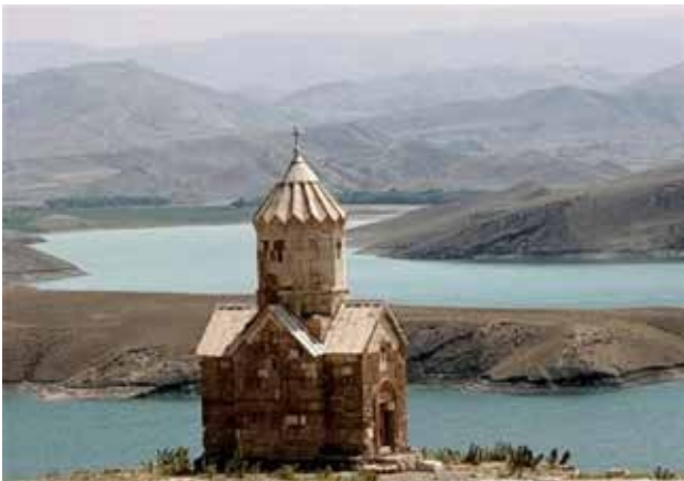
Fig2. A view of Zor Zor (rain) church.