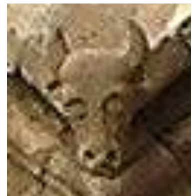
D. Four wings angel