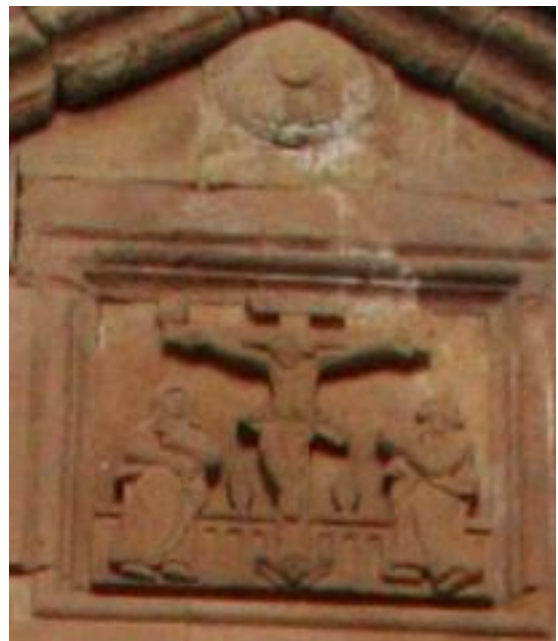
Fig. 9. Crucifixion of Christ image