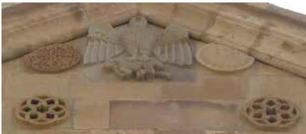
Fig.10. Eagle image carrying the lamb Photo : Golnaz Keshavarz, 2011.