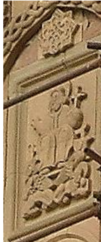
B. One of the apostle image