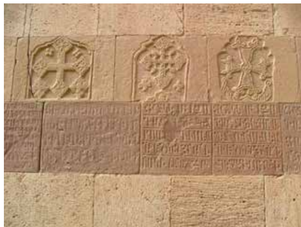
Fig.15. An example of Armenian inscription on the church walls. Photo : Golnaz Keshavarz, 2011.

apostles and saints are in this church, including St. Stephanos and Daniel bones. 22