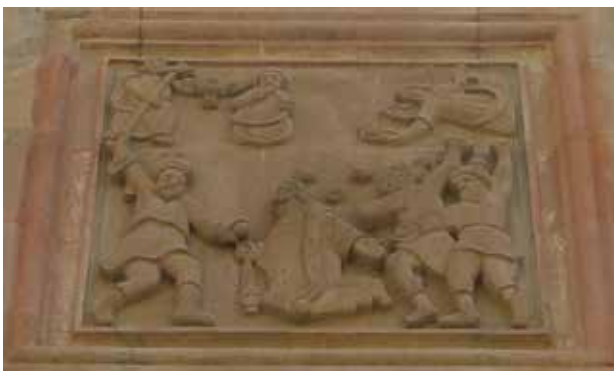
Fig. 11. Stephanos testimony scene

central story character. A pattern like a symbol of Ahura Mazda is also seen. Under this section is a window frame in the form of a cross. The most important point about this cross window is the symbols in the form of animals around it. (Fig.12) A crow is seen on the right and a bull on the left side of top of the cross. Below at the right is a snake and on the right side is two fishes. At the end on the Cross base, two male lion are carved symmetrically.