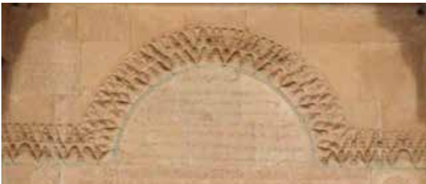
Fig.8. Image of Persian inscription over the entrance