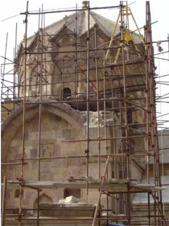
A. Bull head Image

lar box a scene of a story is seen. It is probably the scene of martyrdom of Stephanos. (Fig.11) We can recognize tree stones on the top of Stephanos head. 16 A censer is seen in his hand. 17 three angels are traced as the sign of the holiness of the