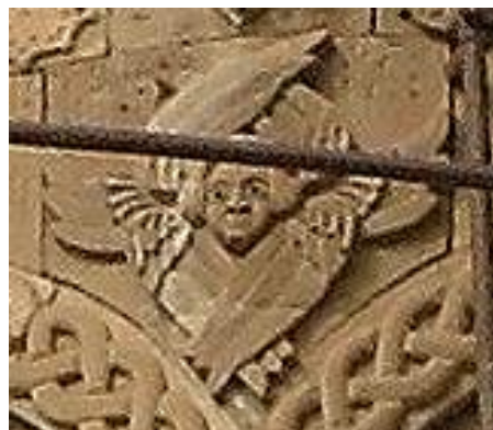
C. Image of cross and shames