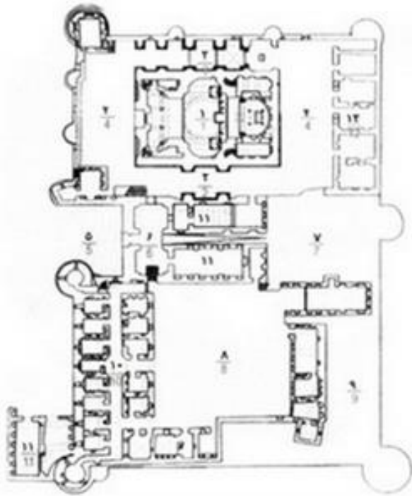
Fig.17. An example of a stone prayer room of the church.

and celebration of Fire were hold in Atashkade and some existing temples were converted into Atashkade at that time. Many of that ancient Atashkade are still called “daremehr” (door of Mehr) that shows their relationship to Mehr in the past. Most of these buildings were built on height and near the mountains and fountains. It seems that in some times Mehr and Anahita Prayers and rituals commemorating of fire has been established at the same time in one place. As the same as this event repeated at the time of the spread of Christianity for many of the Mehr temples again. With a different that at this time Christianity was under the influence of ancient Iranian religions. Follow it in making most of the Christian holy places the former ancient holy places were used again in cultural land of Iran. This fact can be recognized by environmental, landscape and engraving pattern Signs in the first