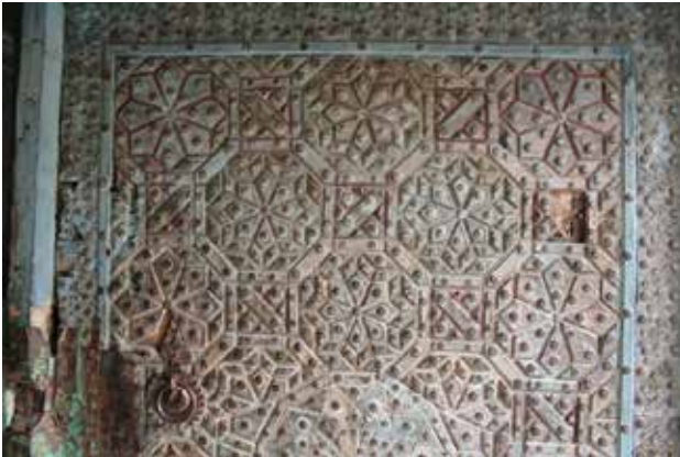
Fig. 6. The inlaid entrance door Photo : Golnaz Keshavarz, 2011.