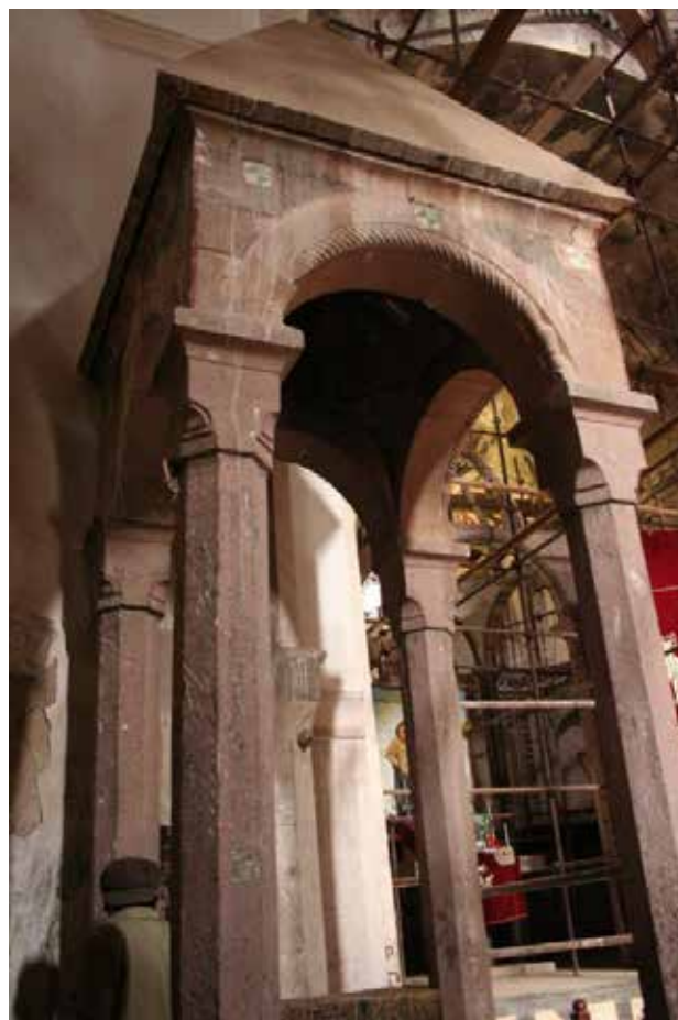
Fig.16. St. Stephanos church plan.

Today many holy sites that located besides water or one day there existed a fountain or a holy tree are relics of ancient beliefs and have root in Mehr and Ananhita cults. Many of these places in the time of Zoroastrian in Iran changed to Atashkade. When Zoroastrianism was the official procedures in court, Mazda's role was so crucial. But still the gods of water and sun, Ananhita and Mehr, were existed as Mazda fellowships. Respect for natural elements like water, fire, plants were also in behavior and orders of Prophet Zoroaster, and was continued from the past. Prayer