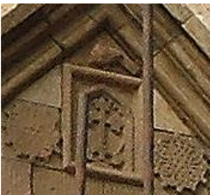
B. One of the apostle image