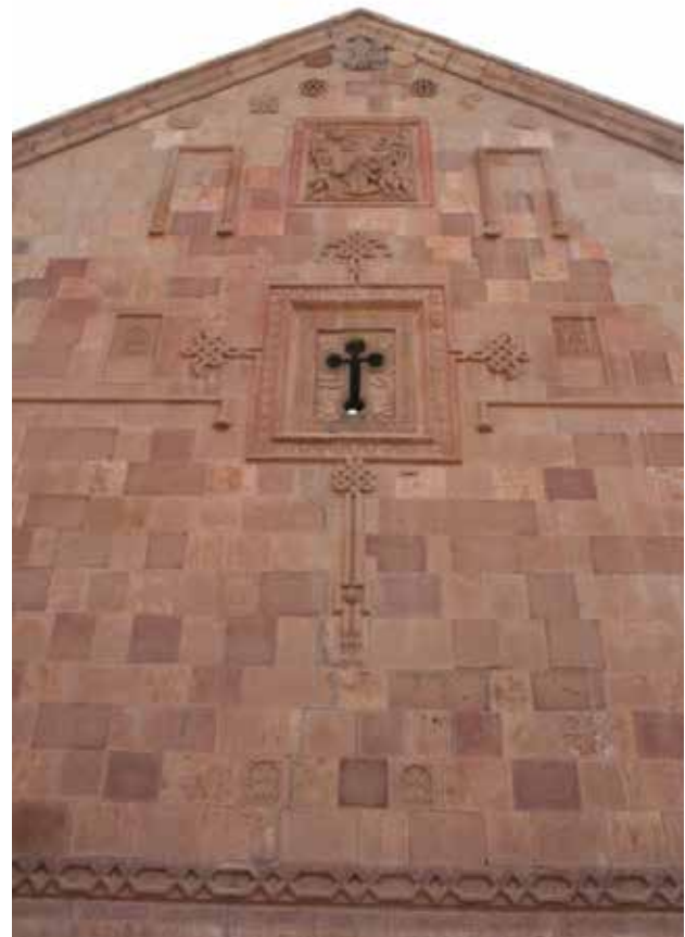
Fig.13. Overview of the east wall of the church. Photo : Golnaz Keshavarz,2011.