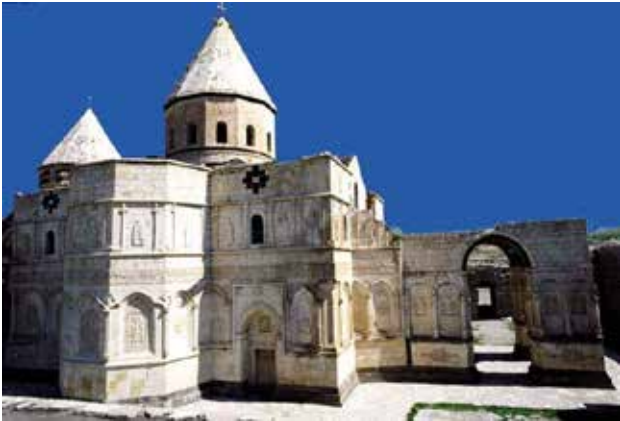
Fig1. A view of Gharakelisa.