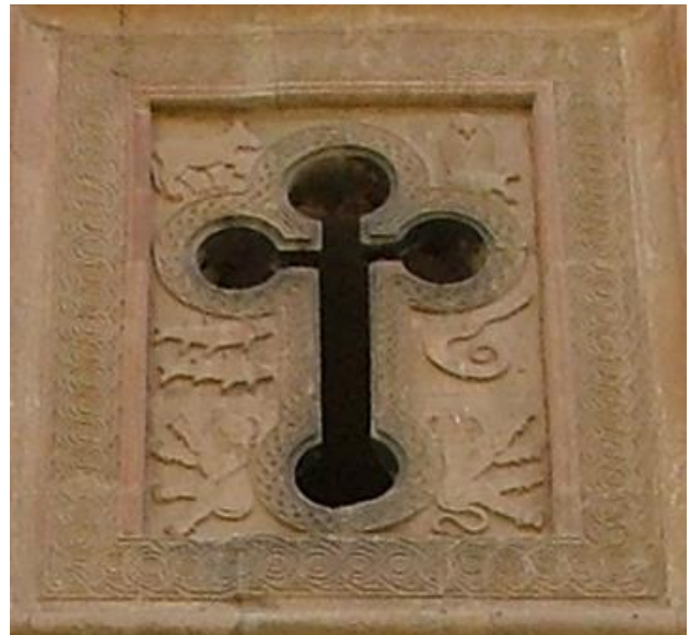
Fig.12.Crusade window and five mehr symbol around it. Photo : Golnaz Keshavarz, 2011.

In Tavernier itinerary, the famous French explorer in safavid era, and pictures archives of Golestān Palace that are taken by “alikhān vali”, the roller of north Azarbayjan in Naseredin shah in Qajar period, it is mentioned that bones of Chris